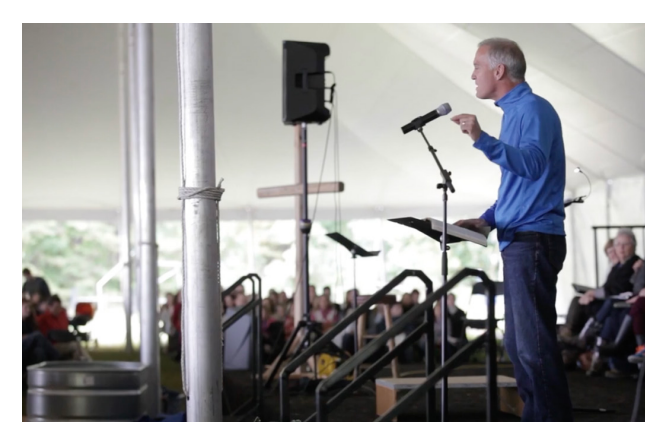
Want more videos in their entirety?